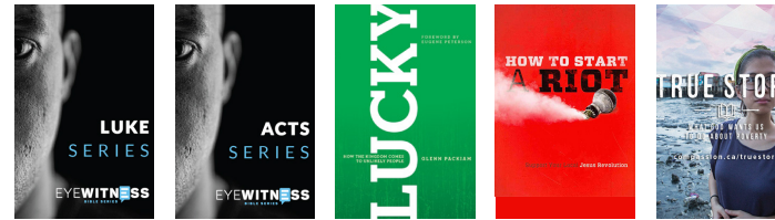
Luke Series Eyewitness

Check out the following resources on RightNow Media: Don't have an account yet? Head to jacobswellchurch.church/rightnow-media/ to get a free account through Jacob's Well!